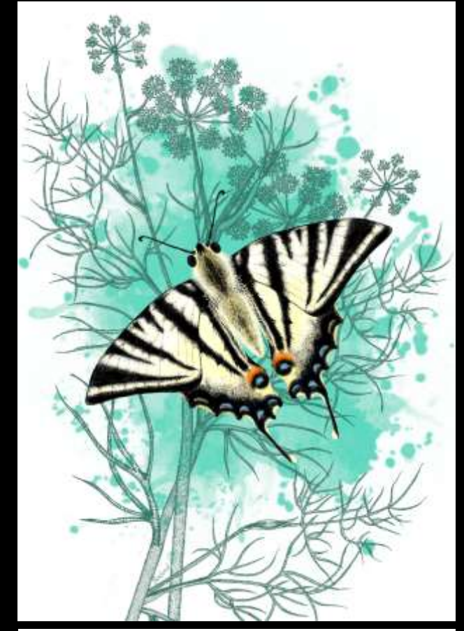
Figure 7. Nature as a compiler of emotions