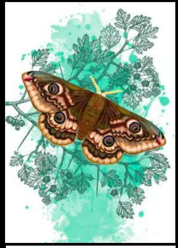
Figure 8. Nature as a compiler of emotions