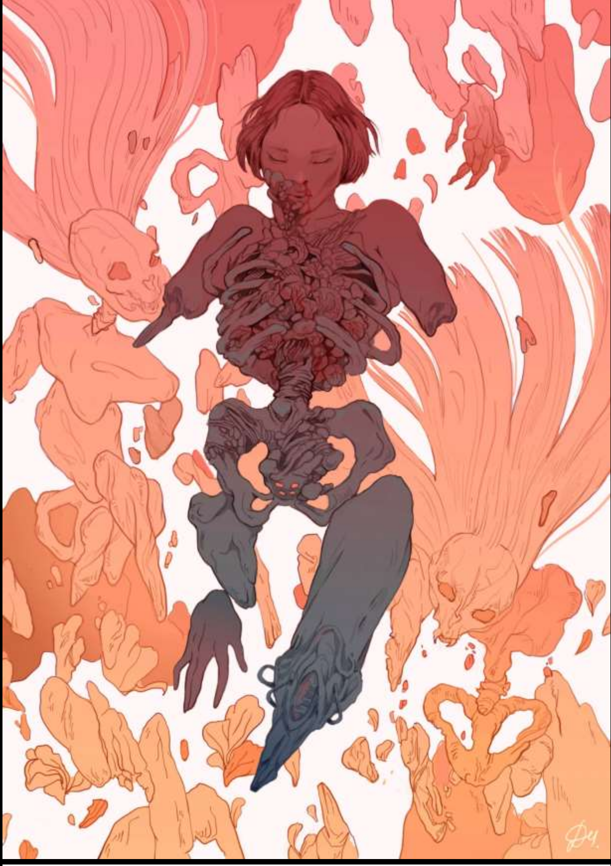
Figure 4. Create or Destroy