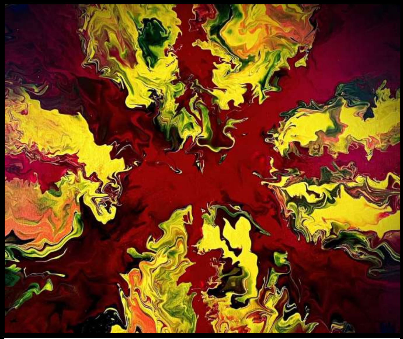
Figure 5. Radius X, Georgina Tsismalidou