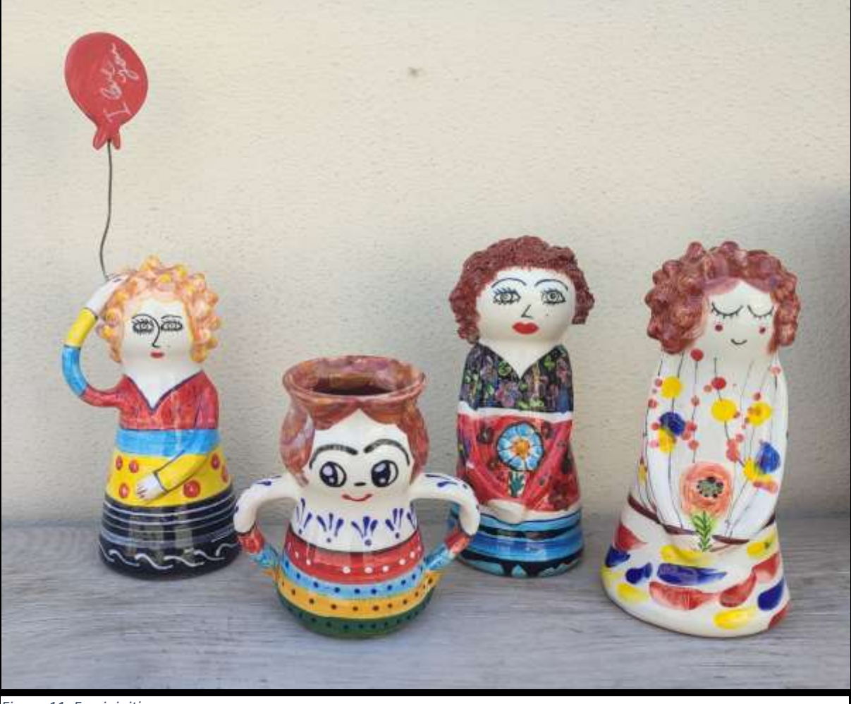
Figure 11. Femininities