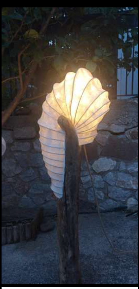
Figure 10. Metamorphosis